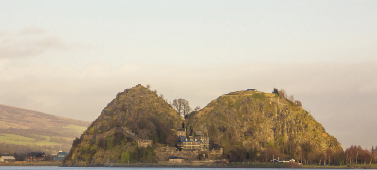
Dumbarton Rock

The story of Viking activity around the Firth of Clyde begins with the siege of Dumbarton Rock in AD 870 and ends with the Battle of Largs in AD 1263. Evidence for this activity can be seen in the landscape, and in the form of small finds and grave goods. They tell us that Norse families settled here, while historic accounts of battles and invasion routes describe the Norse struggle for control of this beautiful and resource-filled landscape.