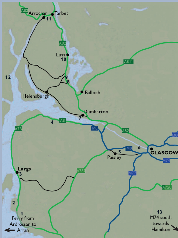
Graphic design: Indigo Design, Glasgow

www.hiddenheritage.org.uk/explore/viking-research/