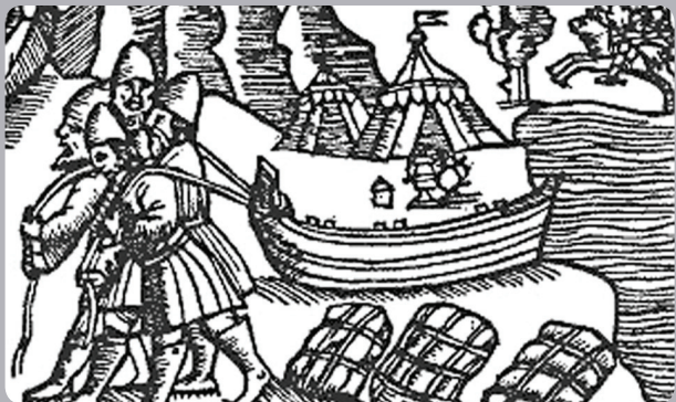
Olaus Magnus, 1555

The story of Viking activity around the Firth of Clyde begins with the siege of Dumbarton Rock in AD 870 and ends with the Battle of Largs in AD 1263. Evidence for this activity can be seen in the landscape, and in the form of small finds and grave goods. They tell us that Norse families settled here, while historic accounts of battles and invasion routes describe the Norse struggle for control of this beautiful and resource-filled landscape.